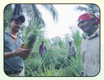
All of the steps between farming, production and selling are within our control